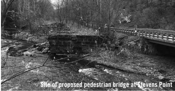
Site of proposed pedestrian bridge at Stevens Point