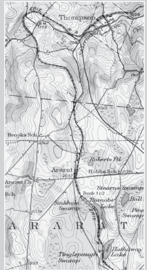
USGS map 1932